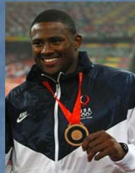
Pictured: Stephanie Brown Trafton & David Oliver